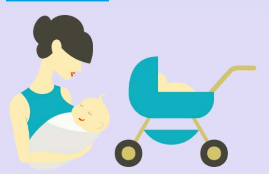
Back to top